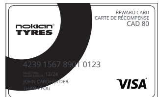
Illustration of the prepaid card as an example only. The received card can be different from that represented here.