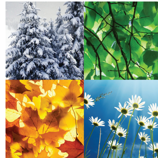
Year-round comfort and energy savings.

Its state-of-the-art low-e technology is sophisticated, but what it does is simple. Dual-action Ecolux helps keep heat out in summer and reflects heat back into the room in winter.