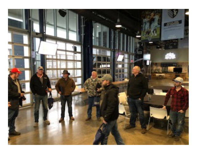
Waiting for the prize drawings and Auction finals. We all had fun despite the snow!