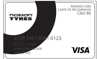
Illustration of the prepaid card as an example only. The received card can be different from that represented here.